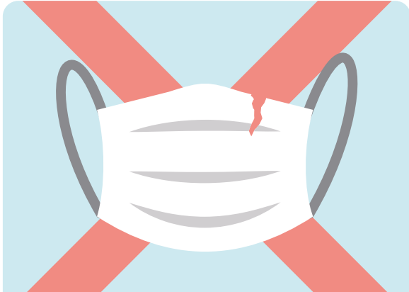
Don't use a ripped or torn face covering.