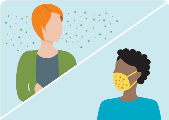
Face coverings can help prevent the spread of illness.