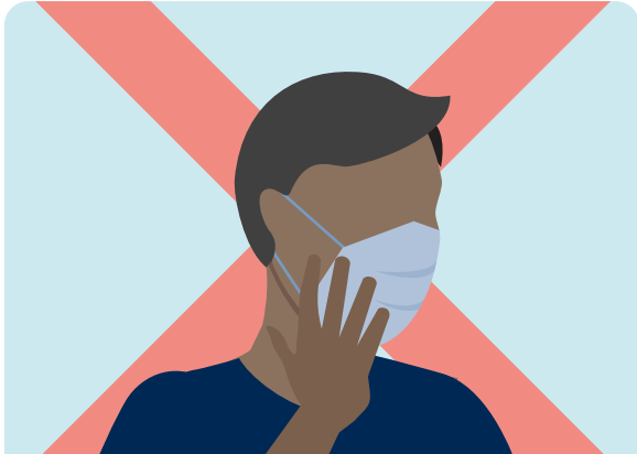
Avoid touching your face or face covering.