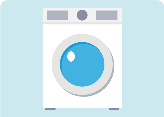
Wash your face covering every day.